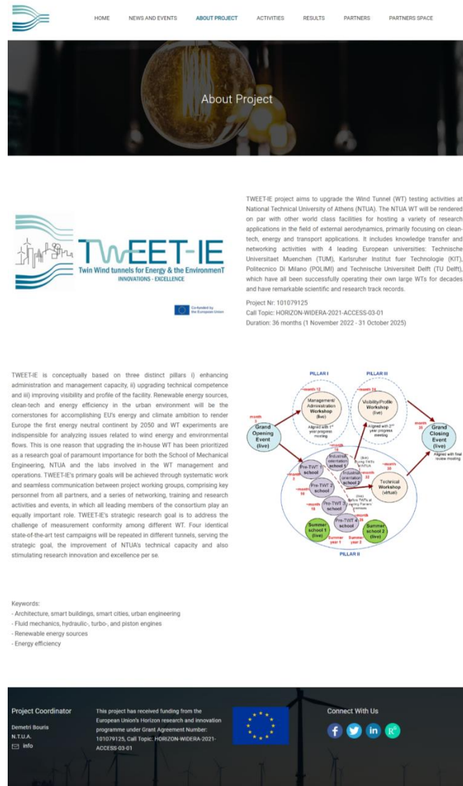
Figure 1 Sample pages from the TWEET-IE project web page